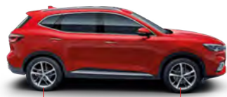
Wheelbase 2720mm Length 4574mm