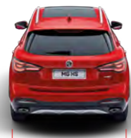
Rear track 1584mm Width - excluding mirrors 1876mm