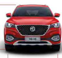
Front track 1573mm Width - including mirrors 2078mm